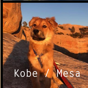
Kobe / Mesa